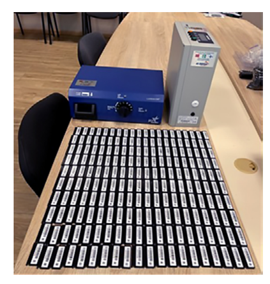
PICTURE 4: Devices donated in 2022 to Exclusive Zone.