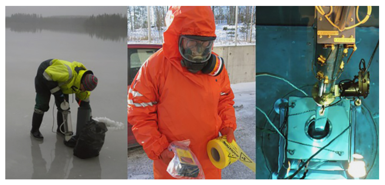
PICTURE 8: Ensuring the Safety: Exploring STUK's activities and response related to Radiation Monitoring in the Baltic Sea region.