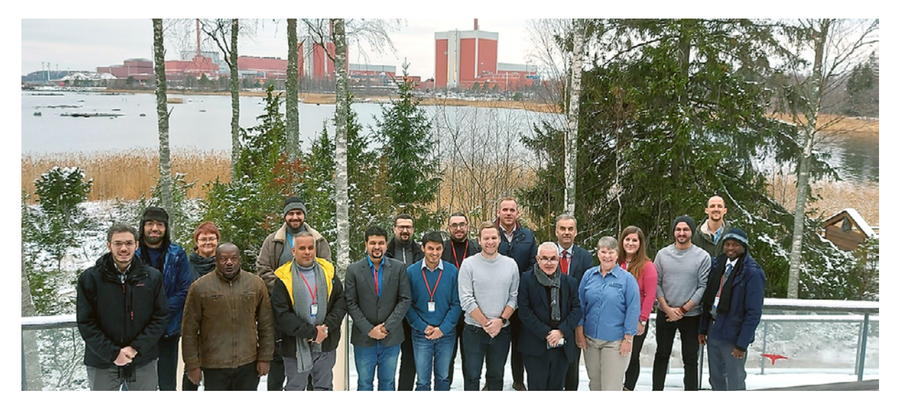
PICTURE 10: An overview of the IAEA Newcomers Course's 2022 visit to Olkiluoto for hands-on learning.

At the end of November 2022, STUK organised a course: "Interregional Training Course on Implementation of National Requirements for Nuclear Power Programmes". Participants came from Argentina, Armenia, Bangladesh, Egypt, Kenya, Nigeria, Poland, Romania, Saudi Arabia, Slovakia, Türkiye, the Czech Republic and Hungary. During the course week, in addition to lectures by IAEA experts, STUK's experts from all fields of comprehensive security as well as on communication and preparedness shared their experiences and practices. Reinforcements also came from Fortum and the former Fennovoima. The course visited the final disposal facility and the encapsulation plant for spent nuclear fuel at Olkiluoto, as well as the emergency response centre of STUK. The course was implemented as FINSP activity (see Chapter 3).