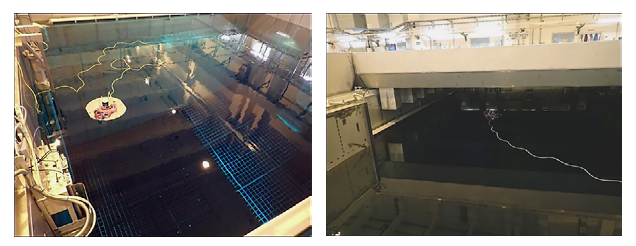
PICTURE 11: Floating CVD robot in action at Olkiluoto spent fuel storage in August 2022.

FINSP had an annual review meeting with IAEA on 7 November 2022.