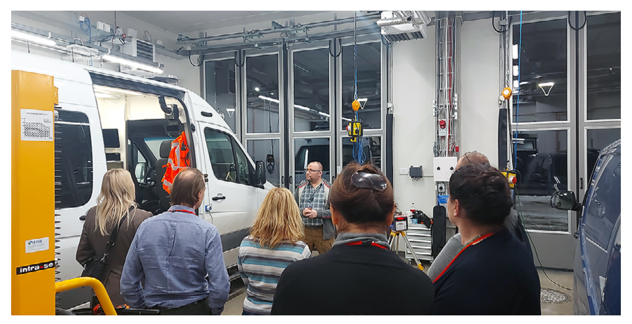
PICTURE 5: Strengthening Disaster and Accident Capacity: Introducing Radiation Measurement Vehicle.