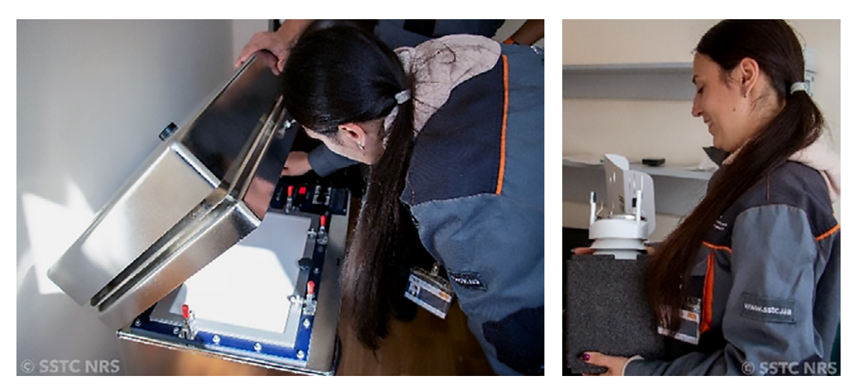
PICTURE 3. Enhancing air monitoring in Ukraine: Air sampler Goblin 200 and Vaisala Weather Station.